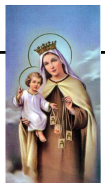
Our Lady of Mt. Carmel